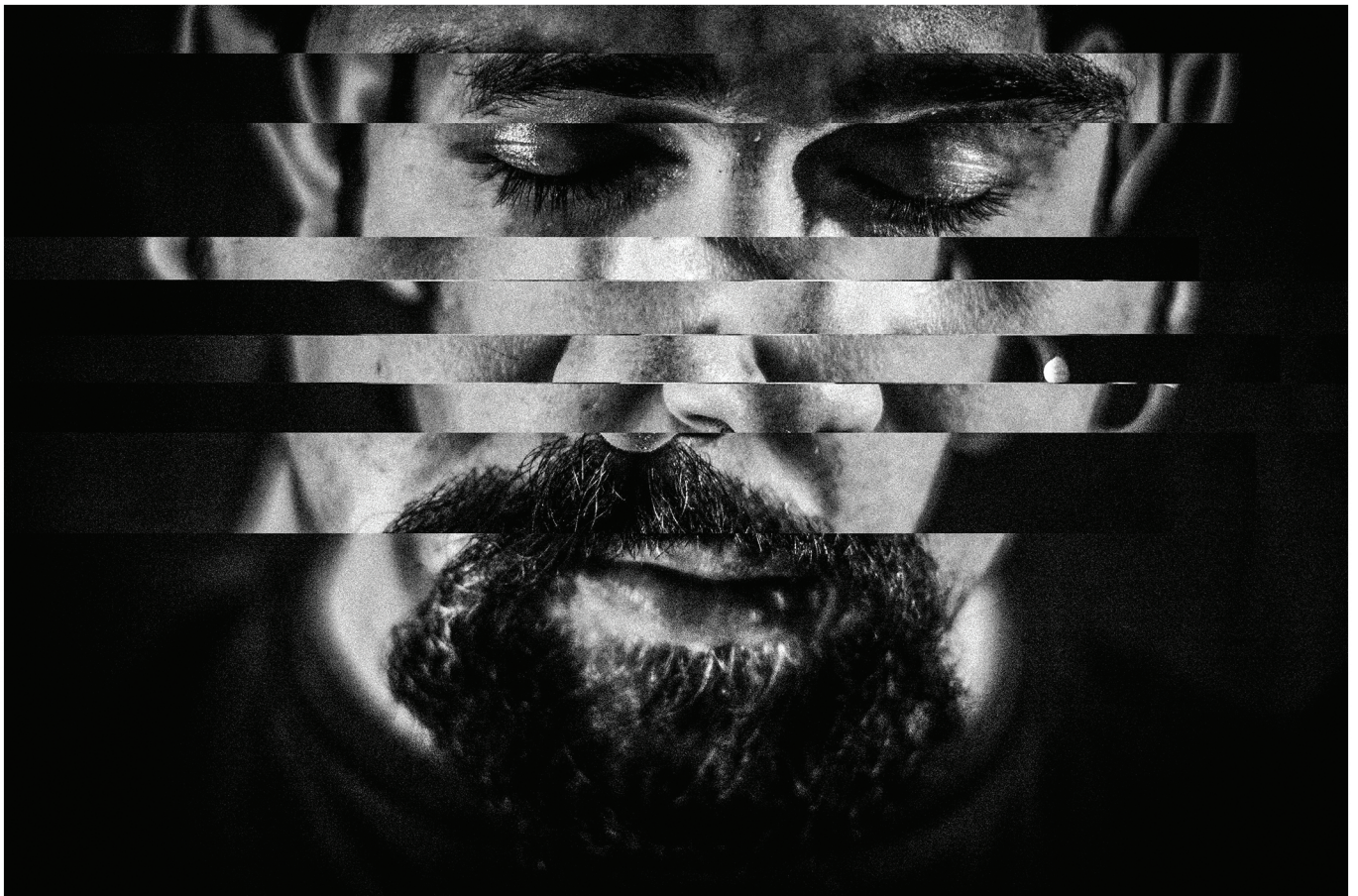
#12 Dissatisfaction Wall, Italy 2013, 118,9 x 84,1 cm Edition 1/5