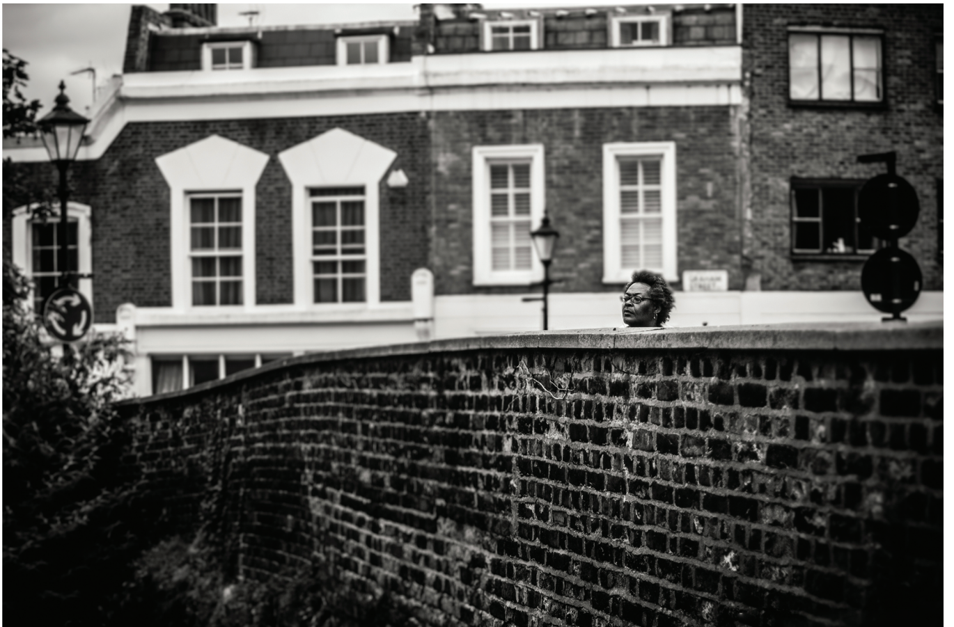
#2 Lost in Islington 50x70cm