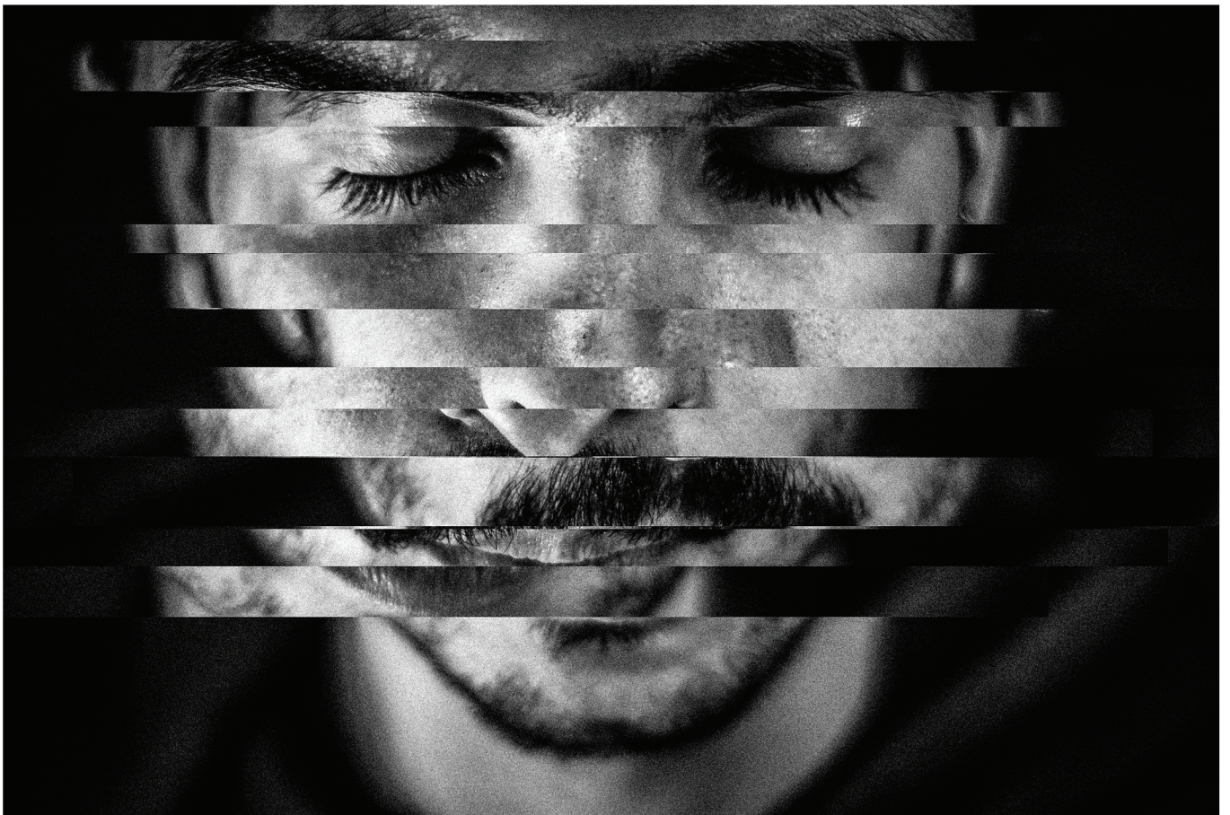
#12 Dissatisfaction Wall, Italy 2013, 118,9 x 84,1 cm Edition 1/5