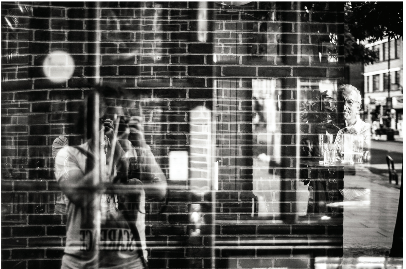
#4 Lost in Islington 50x70cm