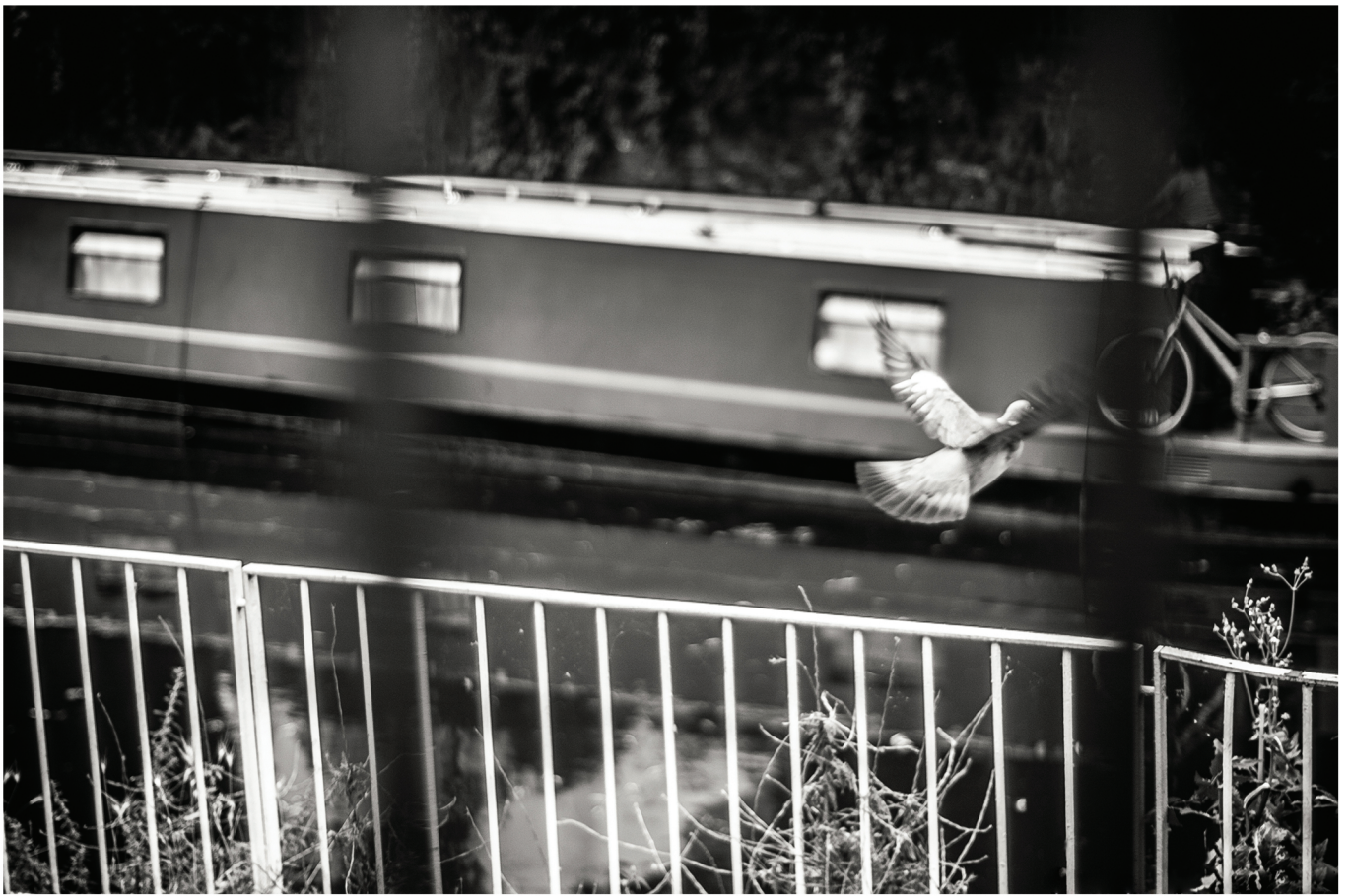
#1 Lost in Islington 50x70cm