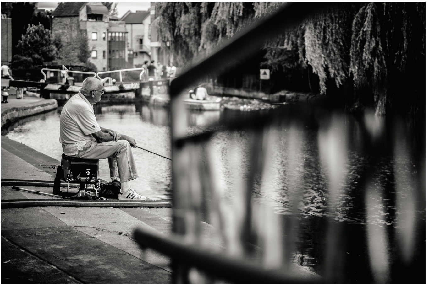
#3 Lost in Islington 50x70cm