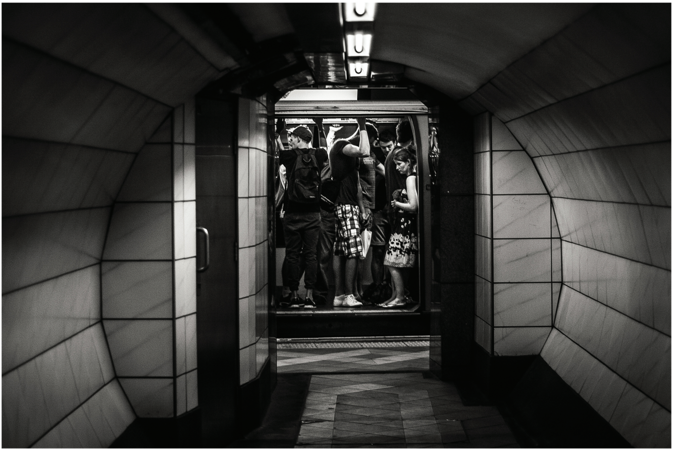
#5 Lost in Islington 50x70cm