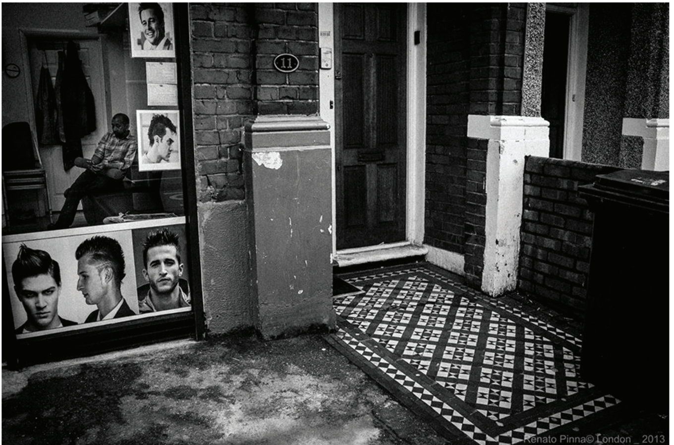
#6 Lost in Islington 50x70cm