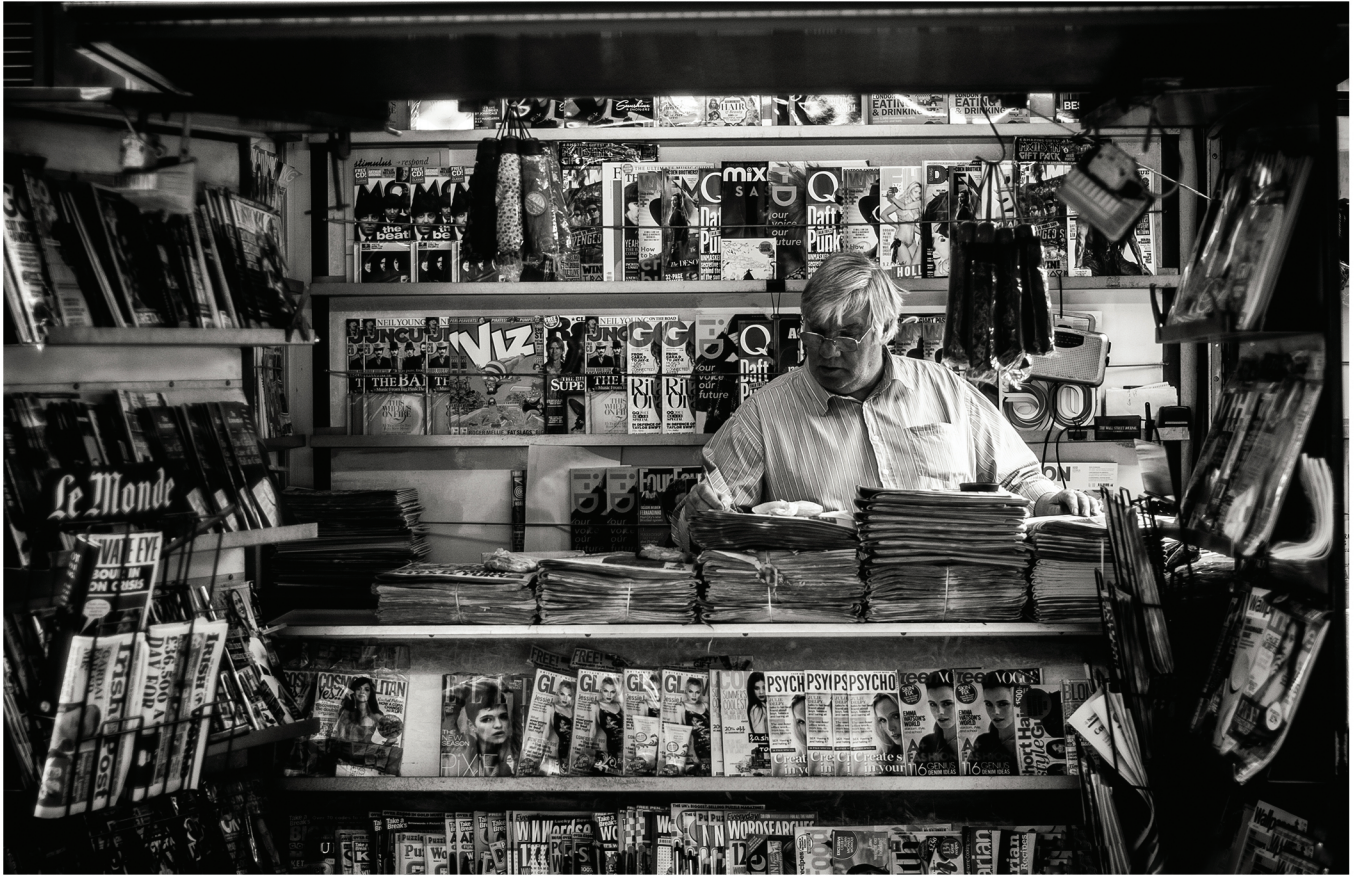
#9 Lost in Islington 50x70cm