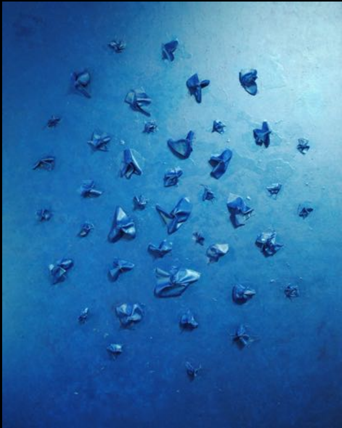
Sapienza Univesrale, 2015, clay, silk, acrylic on canvas, 120 x 150 cm.