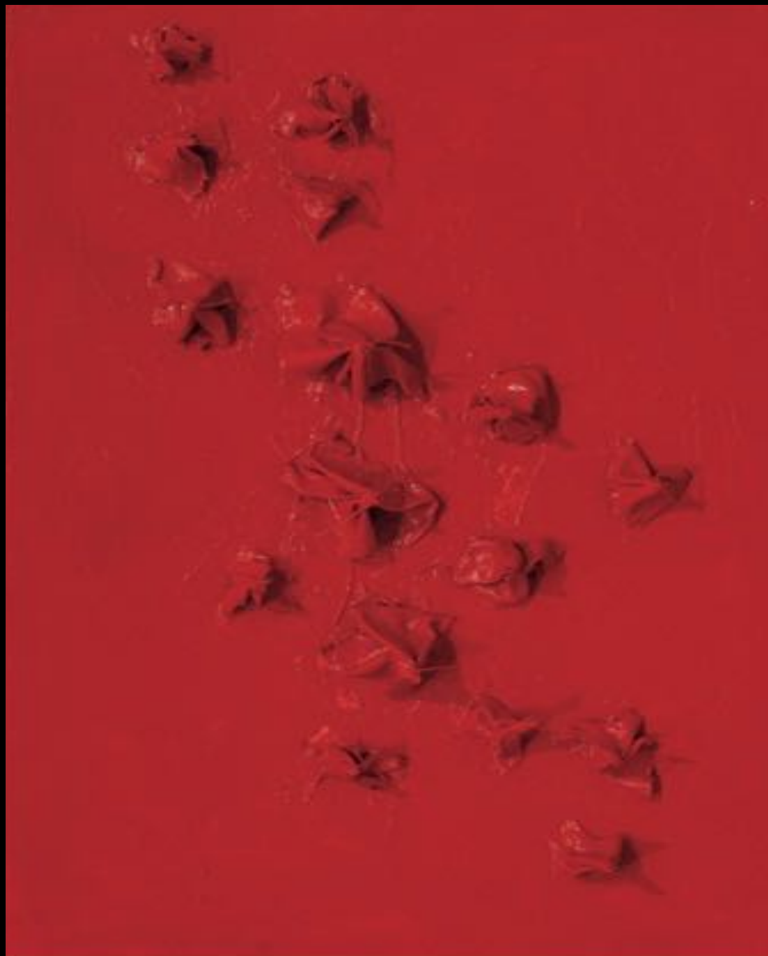
Sapienza Univesrale, 2015, clay, silk, acrylic on canvas, 120 x 150 cm.