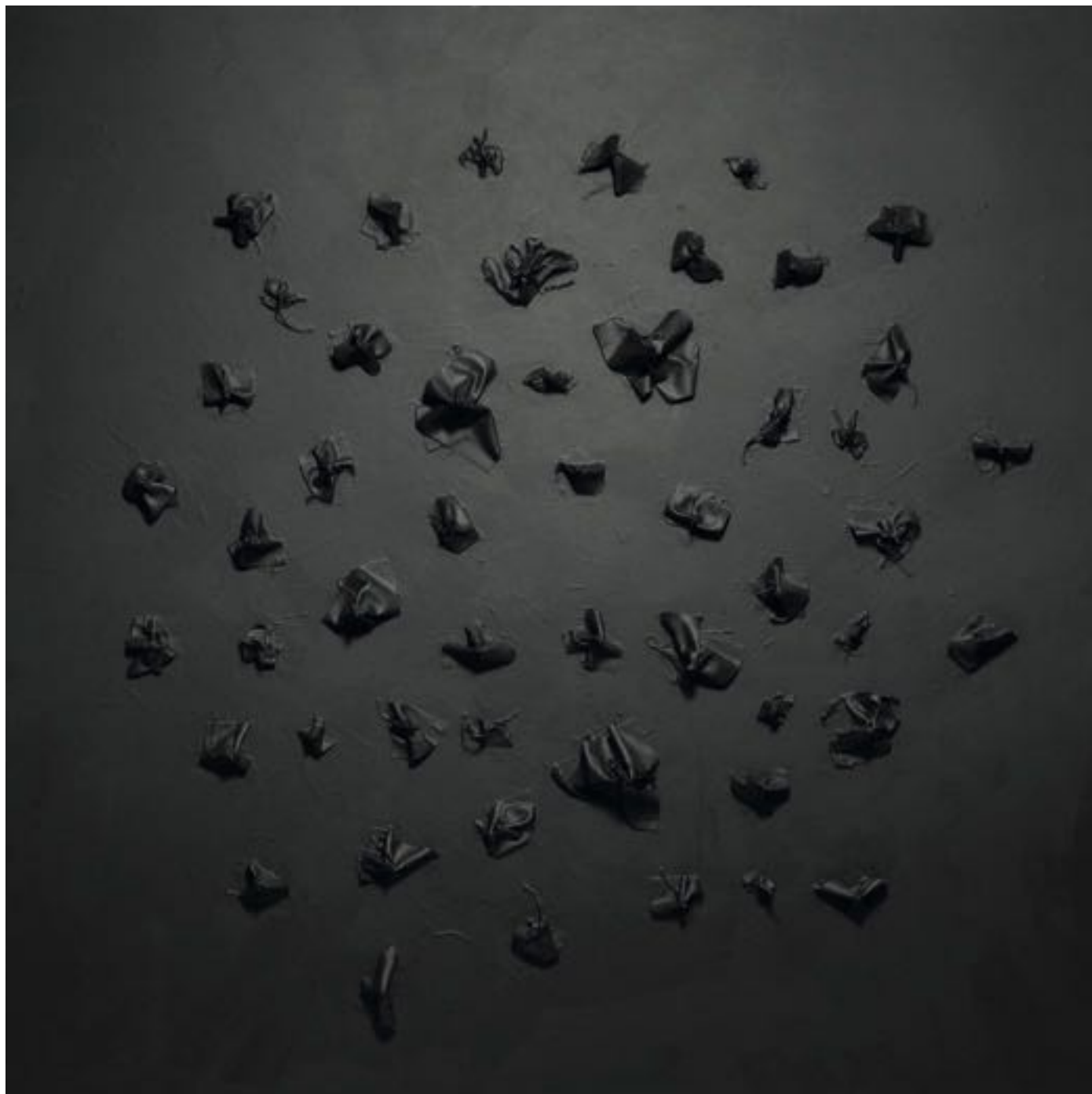
Sapienza Univesrale, 2015, clay, silk, acrylic on canvas, 150 x 150 cm.