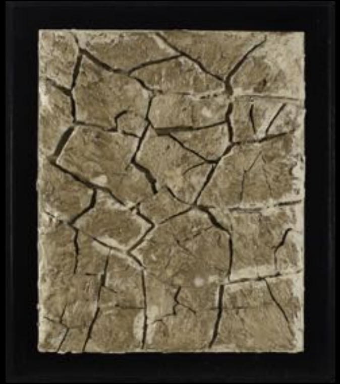
Cretto, 2015, clay and acrylic on canvas, 30 x 24 cm.