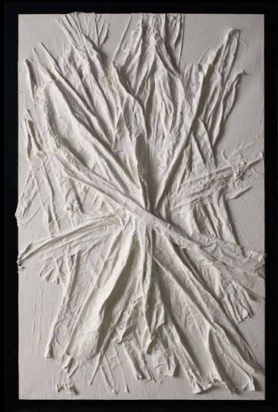
Frammenti di cielo, 2014, resin, cloth and acrylic on canvas, 80 x 50 cm.