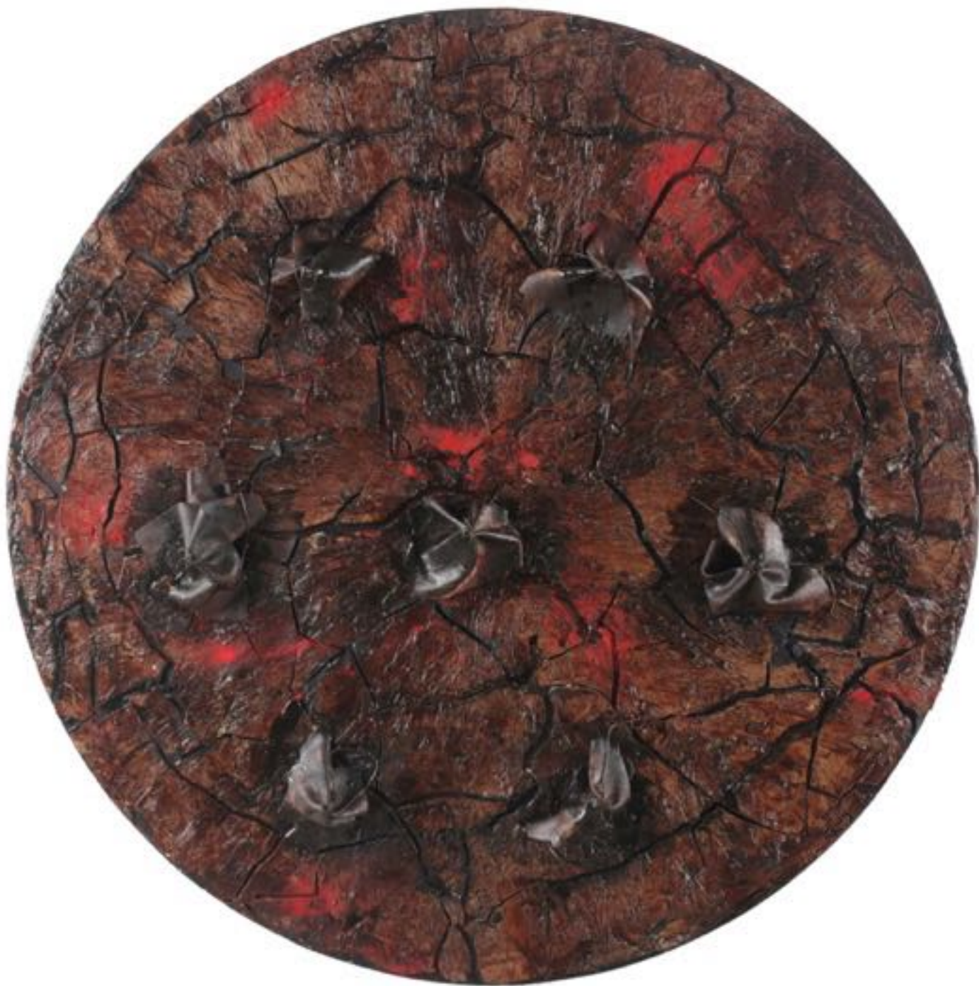
Cretto con Sapienza , 2015, clay, silk, acrylic and natural pigment, on wood panel, diameter 80 cm.