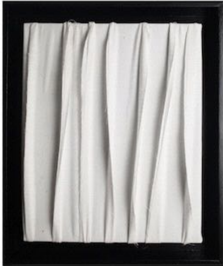
Canale, 2015, resin, cloth and acrylic on canvas