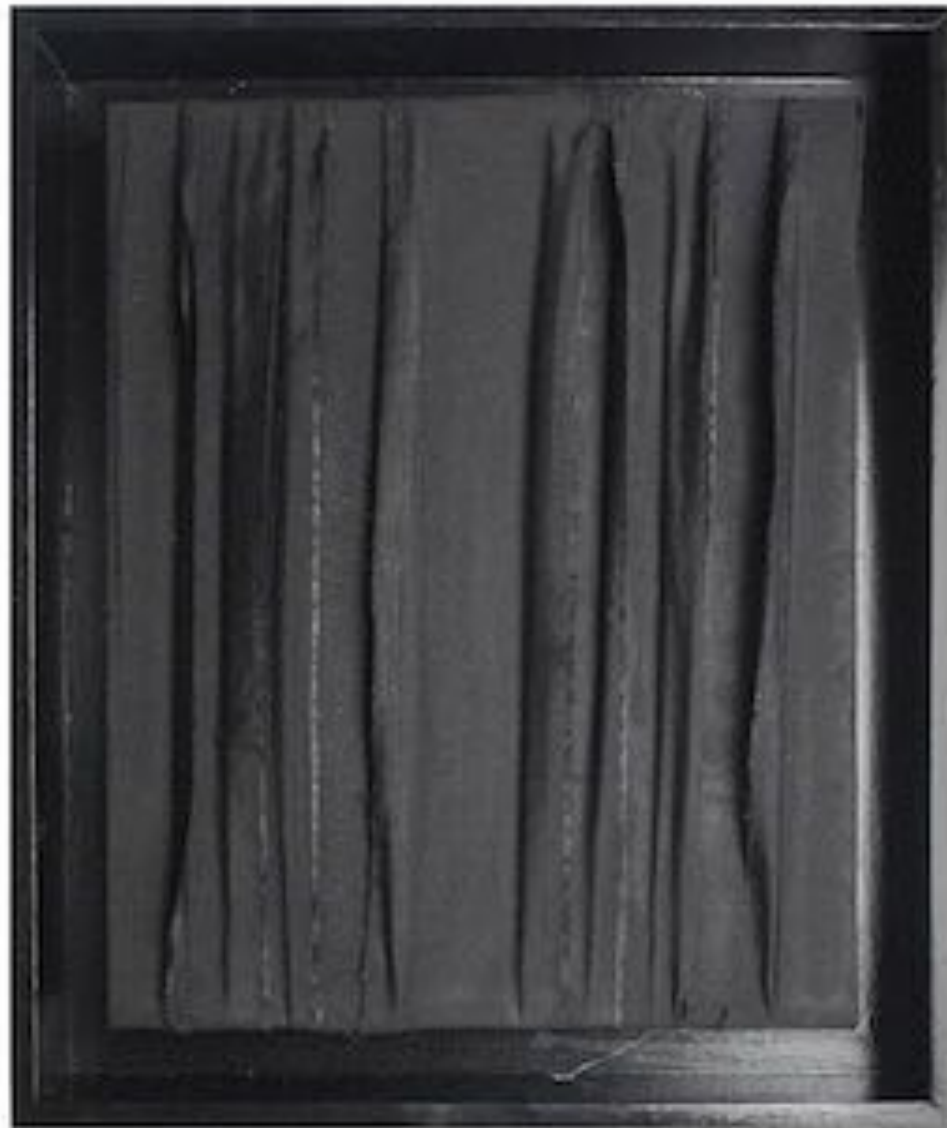
Canale, 2015, resin, cloth and acrylic on canvas