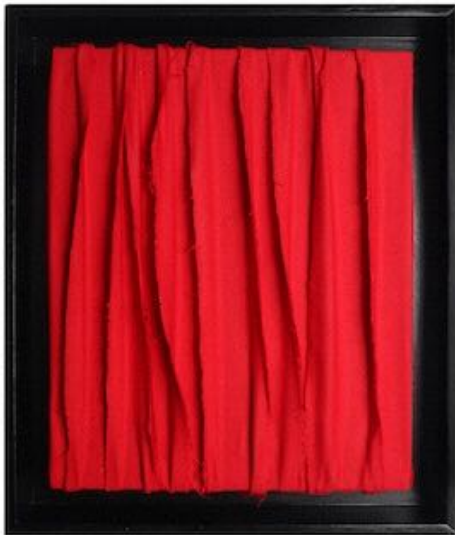
Canale 2015, resin, cloth and acrylic on canvas